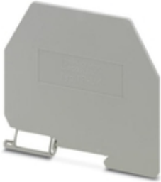
Partition plate, length: 99 mm, width: 2 mm, height: 90 mm, color: gray

Please be informed that the data shown in this PDF Document is generated from our Online Catalog. Please find the complete data in the user's documentation. Our General Terms of Use for Downloads are valid ( http://phoenixcontact.com/download )